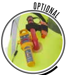
OPTIONAL AIS MOB1 UNIT