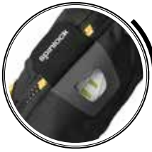
QUICK BURST ZIP & INDICATOR WINDOW