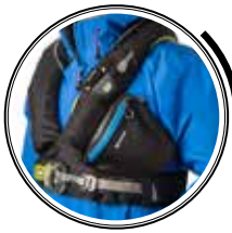
CHEST PACK ATTACHMENT POINTS