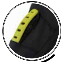
MANUAL ACTIVATION HANDLE