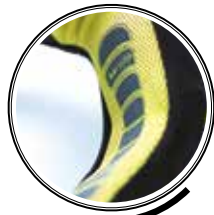
SHOULDER FIT SYSTEM