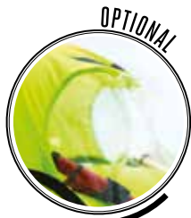
OPTIONAL SPRAY HOOD