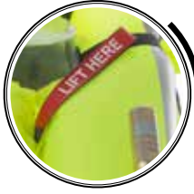
HIGHLY VISIBLE RED LIFTING STRAP