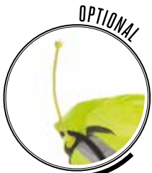
OPTIONAL PYLON™ LIFEJACKET LIGHT